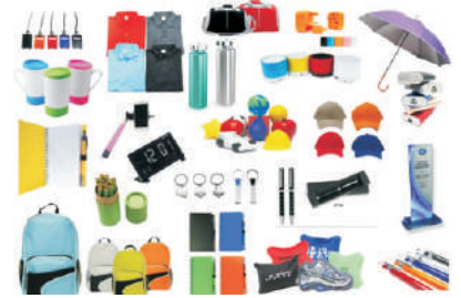
COOPERATE GIFT ITEMS