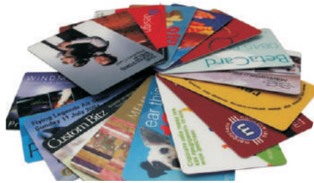
ID & PLASTIC CARDS