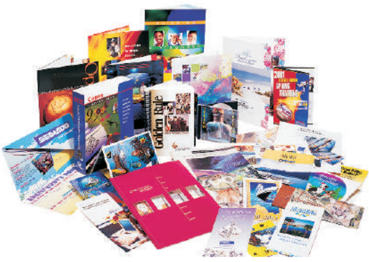
MAGAZINES & JOURNALS