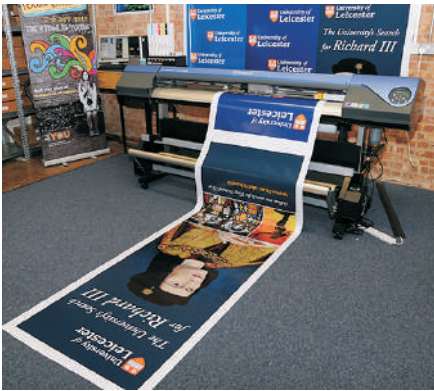
BANNERS & ROLL-UPS