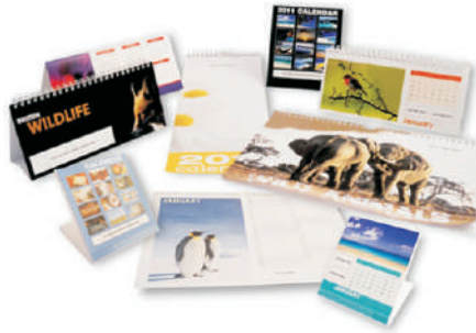
WALL & TABLE CALENDARS