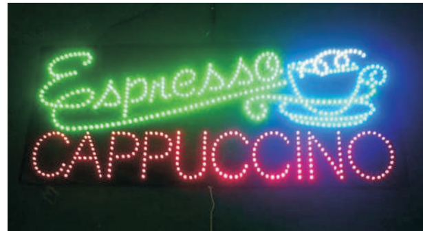
LED POWERED SIGNAGES