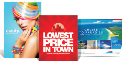
FLYERS / HAND BILLS