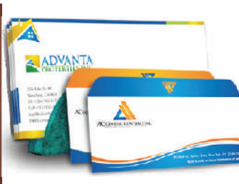
BRANDED ENVELOPES & FILE FOLDERS