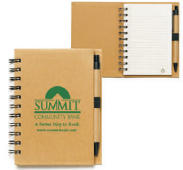
NOTEPAD & JOTTERS